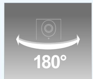
180° Panoramic View